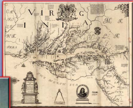
This map was designed by Herrman in 1670.

Before sunrise they cross two runs of water and some dry thickets, figuring their distance to be about five leagues (15 statute miles) from New Amstel. They breakfast at Cimamus or Hare Creek (now Big Elk Creek). They continued south and west through the woods without a path about a league to a waiting skiff and paddles but not rudder or oar. Four guides are dismissed, but Sander Poeyer with his Indian continue on with Resolved Waldron and Augustine Herrman. The skiff leaks badly, so they caulk it with old linens, bailing constantly as they proceed along. They pause on the east branch of the Elk River to build a fire on the woods and then continue with the night ebb and great labor, traveling all night.