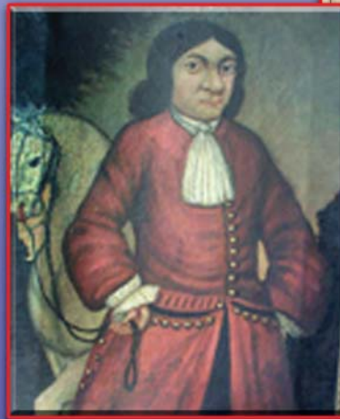
A portrait of Augustine Herrman, which is located at the Maryland Historical society.