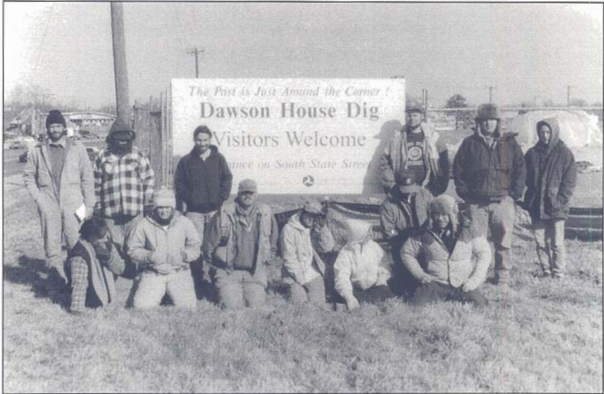
PLATE 1: Dawson Site Crew, Posed by the Highway Sign