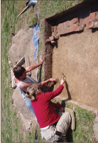
Exposed brick foundation within excavation unit.

The archaeologists are removing soil from inside the foundation and surrounding yard area, collecting the artifacts, and documenting the evidence of the people who lived here. The information from this stage will be combined with data gathered from oral interviews and detailed research to help the archaeologists recreate the life of a tenant family in northern Delaware during the turn of the 19 th century.