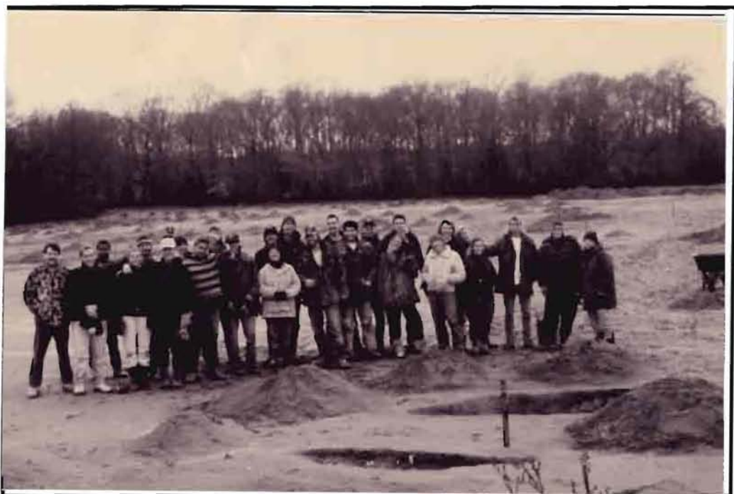
Above: Carey Farm Field Crew at end of Excavations