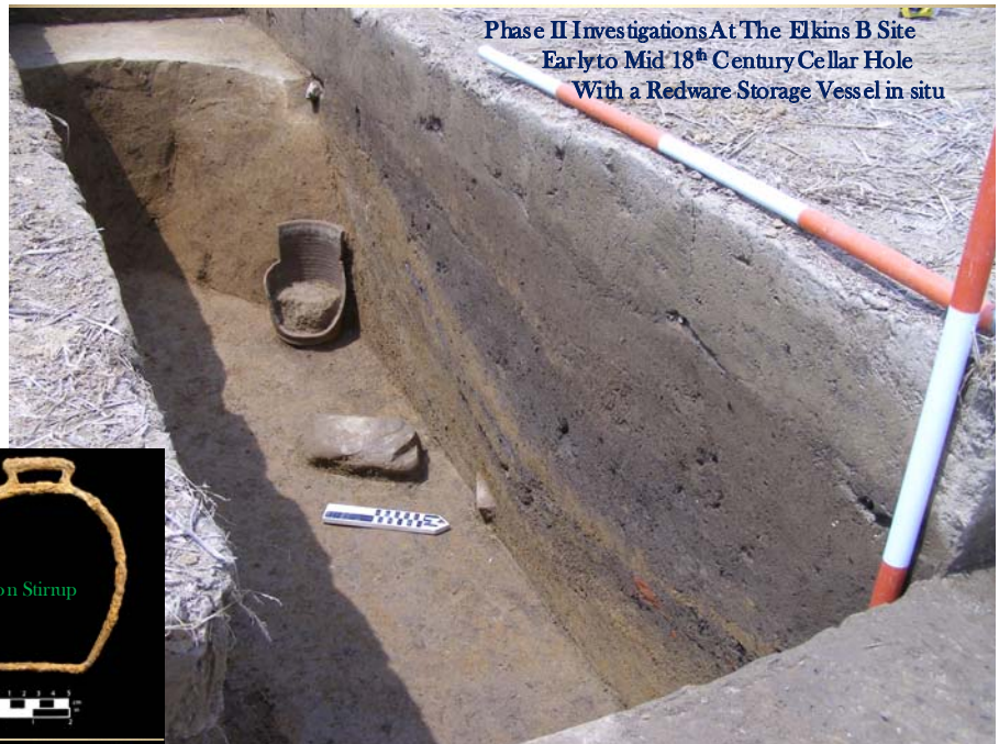
Phase II Investigations At The Elkins B Site Early to Mid 18 th Century Cellar Hole With a Redware Storage Vessel in situ

The artifacts from this cellar hole revealed the former resident had the latest goods from Europe and the colonies.