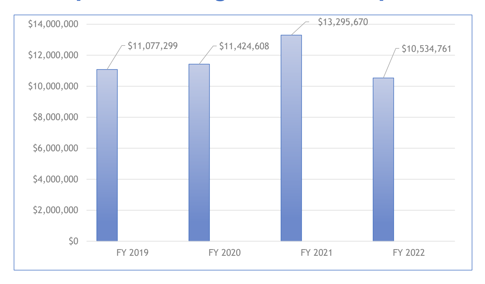
$11.5 million dollars/year to maintain, repair, or replace drainage related infrastructure!