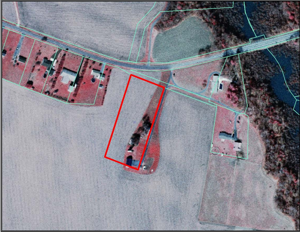
K-02743 tax parcel on 2002 aerial photograph (Delaware DataMIL 2008).