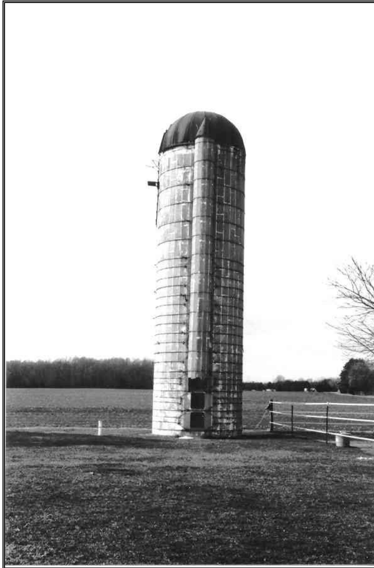
Silo, east elevation, facing west.