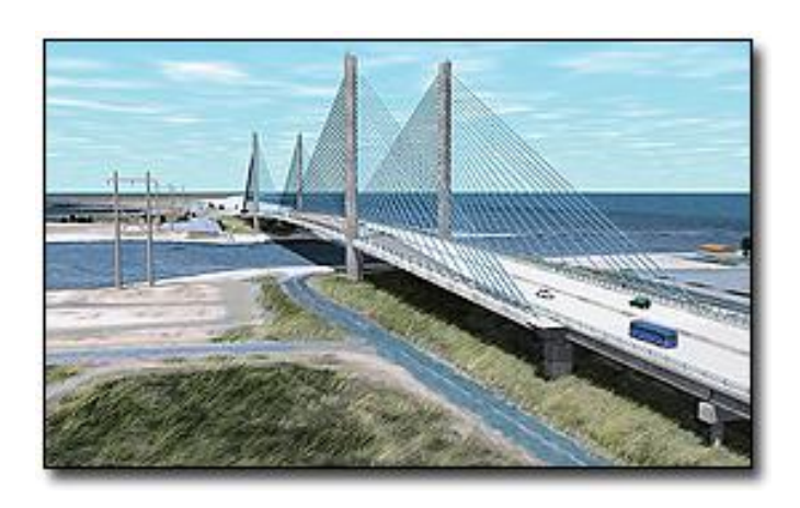
Indian River Inlet Bridge