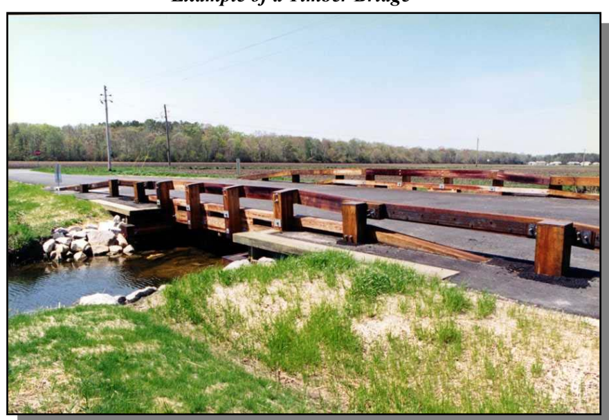
Example of a Timber Bridge