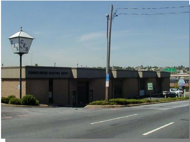
Consolidated Electric – DART III Site Building Renovations