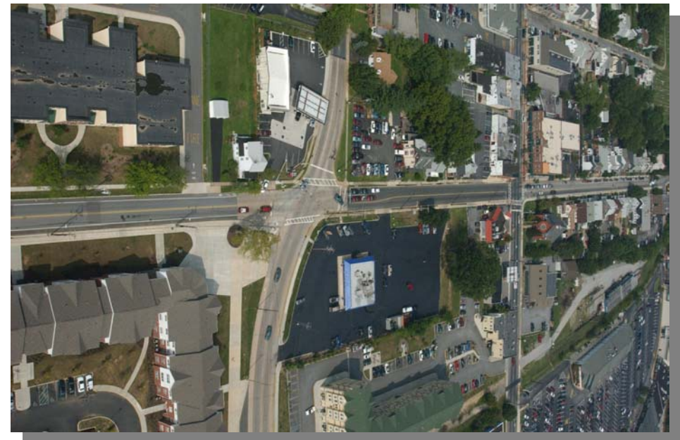
Proposed Site for Newark Transit Hub