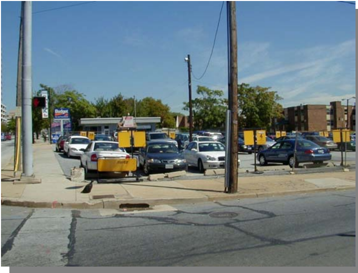
Wilmington Transportation Facility