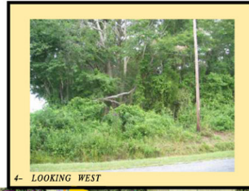
4- LOOKING WEST