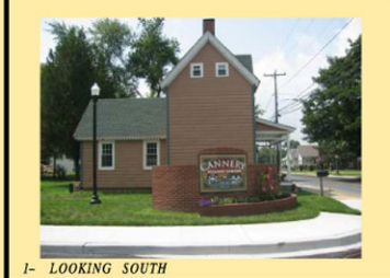
1- LOOKING SOUTH