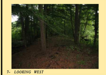
7- LOOKING WEST