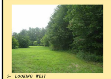
5- LOOKING WEST