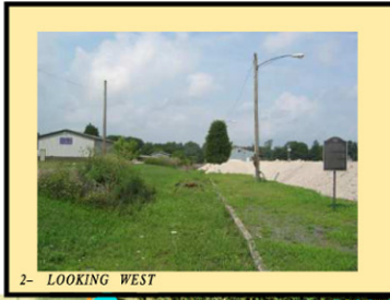
2- LOOKING WEST