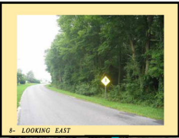
8- LOOKING EAST