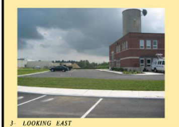
3- LOOKING EAST