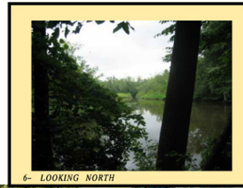
6- LOOKING NORTH