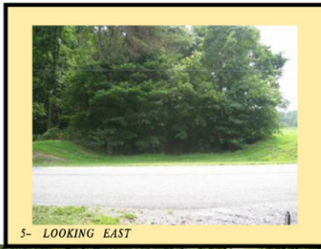
5- LOOKING EAST