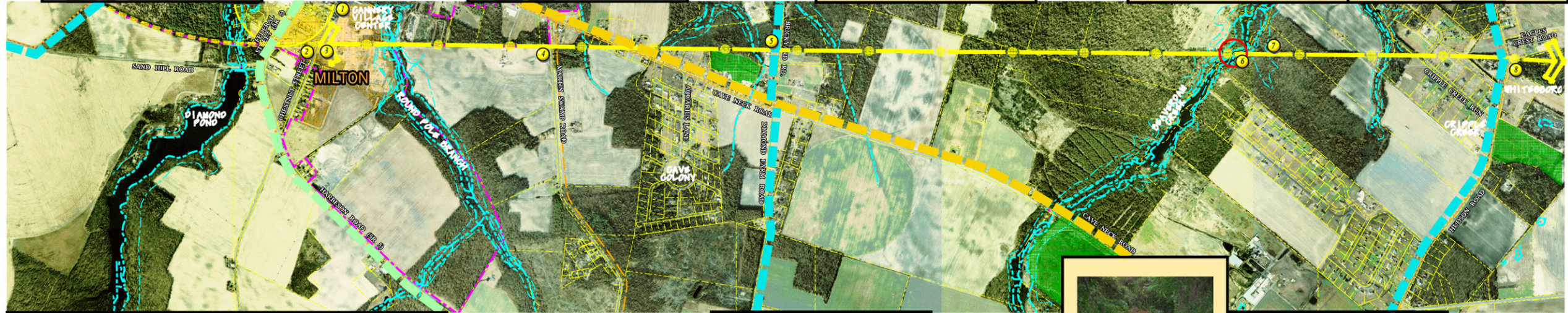
Aerial Image Date: 2002