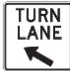
Figure 1. TURN LANE (R3-20-DE) Sign DE MUTCD Figure 2B-4

Furthermore, the DeIDOT Traffic Section will no longer fabricate, maintain, or replace this sign when damaged or via a sign replacement program.