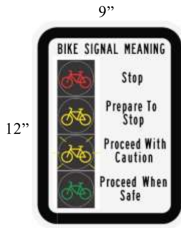
Figure 1: Bicycle Information Sign