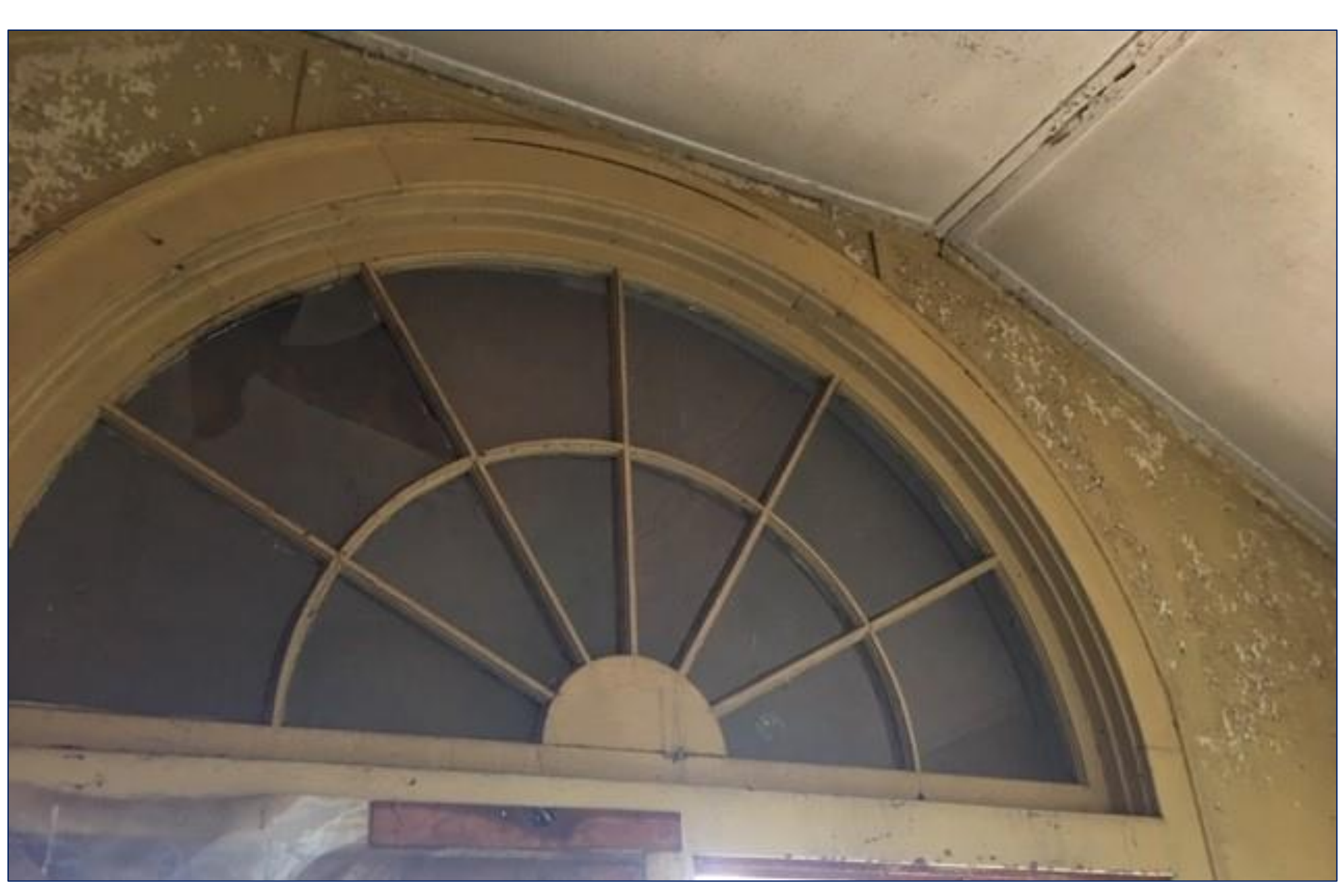
Interior shot of the original fanlight window over the front door

The Nassau School is eligible for listing in the National Register of Historic Places. The two-room school building was constructed in 1922 as part of the du Pont Schools program and served the African American students of Belltown and the surrounding area from 1922 until 1965. Belltown, a historically African American community, was established by free African Americans in the mid-19th century.