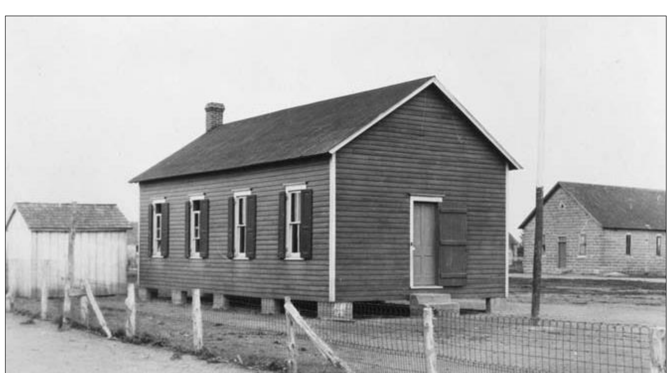
An earlier school building, constructed in Belltown ca. 1911, would eventually be replaced by the Nassau School (Delaware Board of Education, ca. 1920, courtesy of the Delaware Public Archives)

Decades of institutionalized racial segregation in Delaware resulted in a lack of funding and inadequate school facilities for African American children. While free schools for white children were established in 1829 and funded by taxation, free African Americans were responsible for raising their own funds to support their children's schools. In the 1880s, legislation to tax African Americans for schools and provide state support was passed, but this did little to ease the funding burden or racist segregation policies. Despite these challenges, African American communities constructed schools throughout the state, including in Belltown.