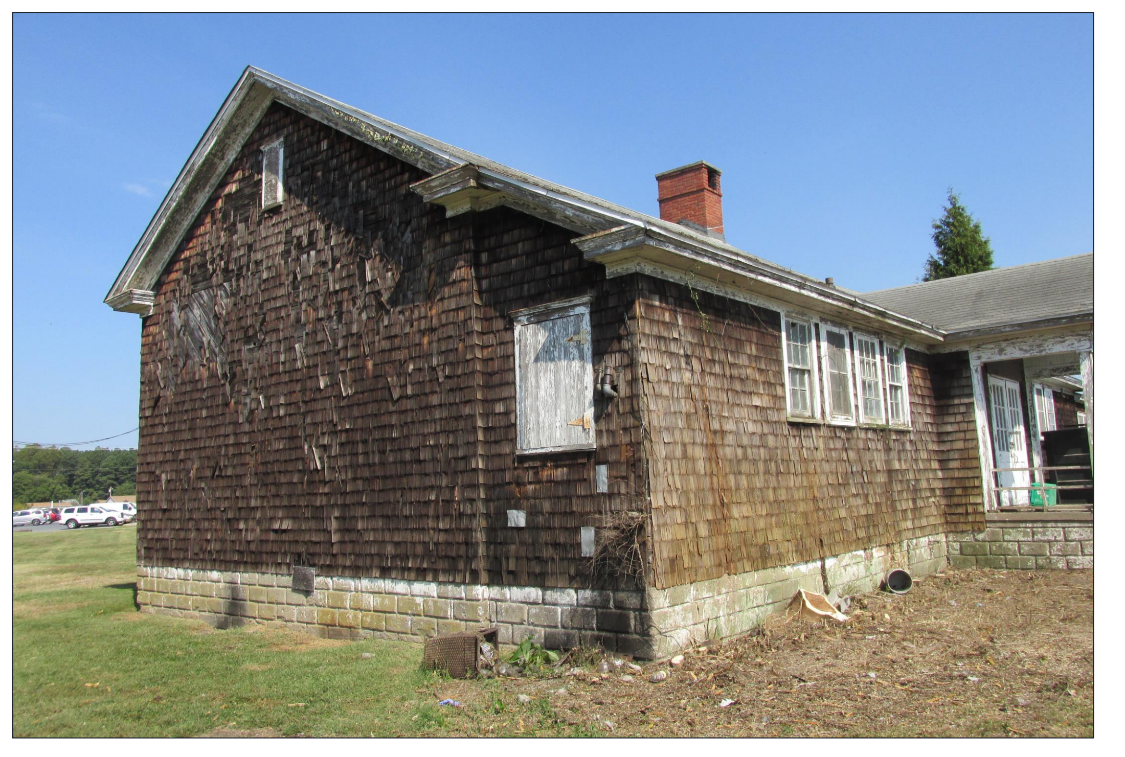
View of the west elevation of the building and the location of the honeybee colony