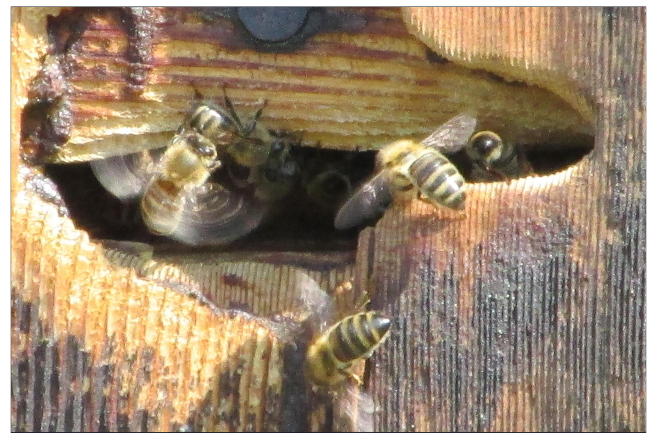
Honeybees are entering the structure through a hole in the siding