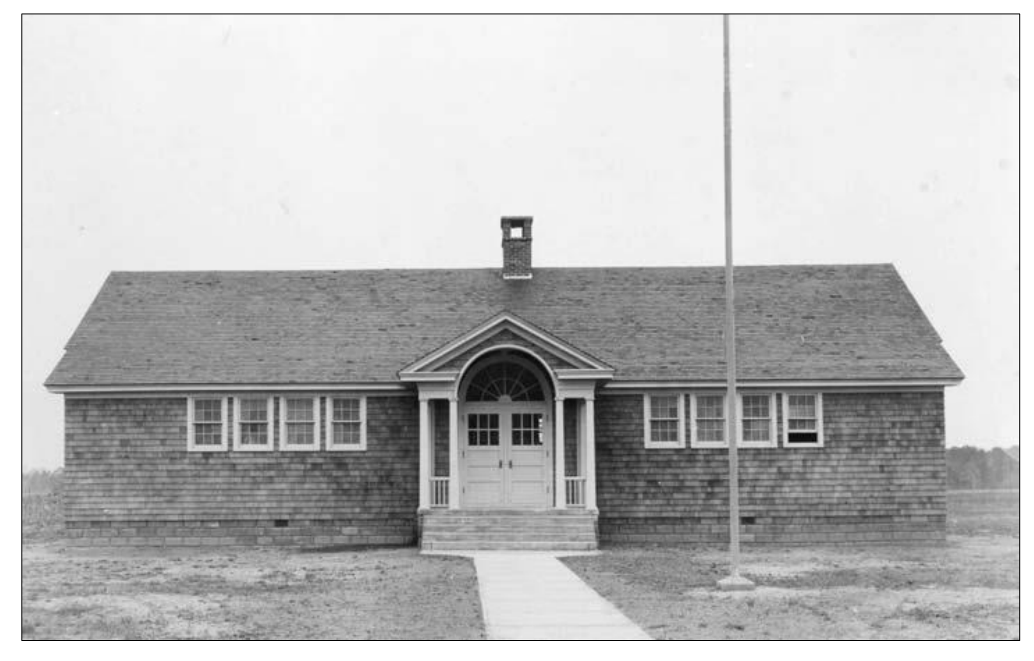
The Nassau School in 1922. Note the original central fanlight, windows, and porch (Delaware Board of Education, ca. 1922, courtesy of the Delaware Public Archives).