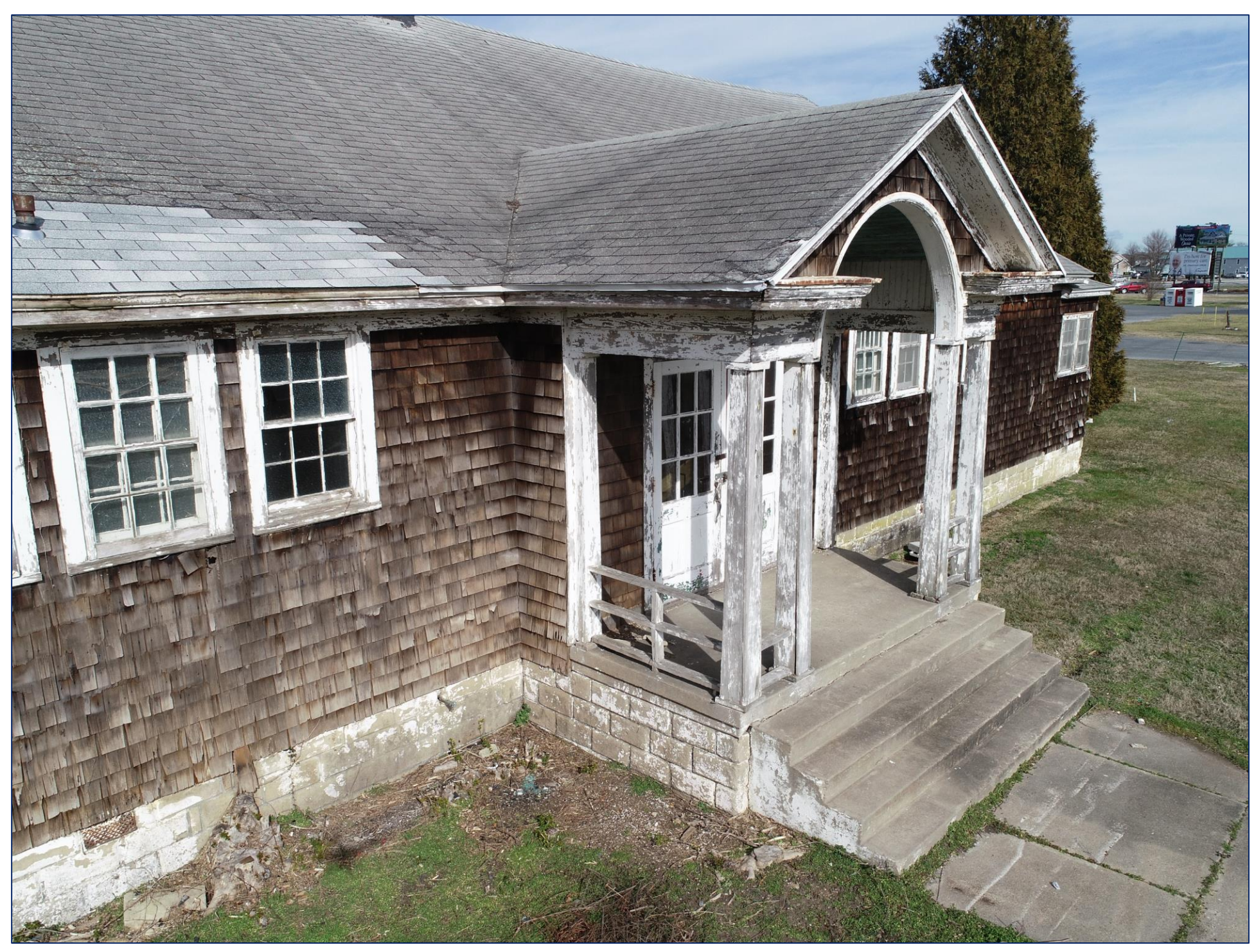
A view of the front porch of the Nassau School.