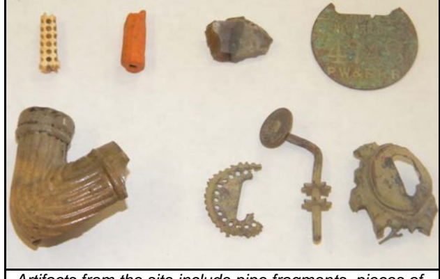
Artifacts from the site include pipe fragments, pieces of an oil lamp, and part of a toothbrush made of bone.

When a site this significant will be affected by construction, the law also requires that the impact be mitigated by recovering as much information as possible beforehand. From July to mid-September of 2012, Dovetail will conduct a "dig" on this site (more properly called a data recovery project or mitigation). During this time, we will search for artifacts for dating, and other physical evidence of past occupation of this site, as well as maps and records in courthouses and archives.