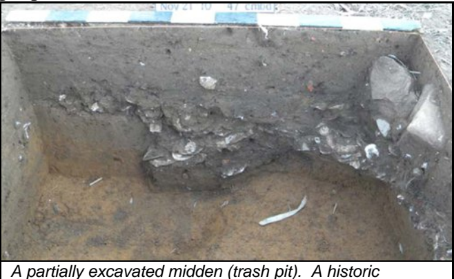
A partially excavated midden (trash pit). A historic people's trash is an archaeologist's treasure.

Our work here in the field will consist of excavating ten 2x2 meter squares by hand, to see how and what kind of artifacts collected in the soil over time. The plowzone soil on the remainder of the site will then be removed using a backhoe. Once this is done, we should be able to see the entire house foundation and cellar. The size. shape, and layout of the foundation can often tell architectural historians exactly what style of house once stood on the site. Removing the plowzone will also expose stains in the soil where wooden posts decayed, showing the outline of old fence lines and post-in-ground structures. And. importantly for archaeologists, it will reveal old wells and privies (outhouses), which were often partially filled in with debris, as well as middens (trash pits). Since trash tends to accumulate in layers, archaeologists can tell changes in diet and relative wealth or poverty based on what past peoples threw out.