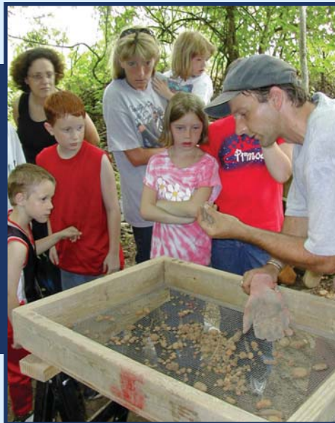
Even the smallest artifact deserves careful inspection. Above, a KSK archaeologist demonstrates excavation methods to local children.

Site 7NC-E-152 was initially found in the spring of 2001 during preliminary archaeological studies of areas to be affected by proposed improvements to the Airport and Churchmans Roads intersection. More extensive excavations performed in 2002 turned up hundreds of stone tools and other artifacts, and led DeIDOT and Delaware State Historic Preservation Office archaeologists to believe that Site 7NC-E-152 represented an important archaeological discovery that was eligible for listing in the National Register of Historic Places.