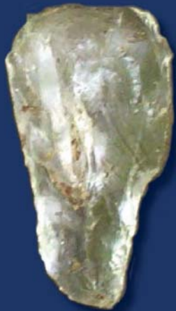
Quartz endscraper, a stone tool used by Native Americans, found at site 7NC-E-152

carbon-14 dating, will be used to more accurately determine how old the site really is. A team of specialists, including geomorphologists and paleobotanists, will attempt to reconstruct the local environment at the time the site was occupied by studying the physical and chemical characteristics of site soils, and the remains of long decayed plants preserved within the ground. During the analysis of the site's discoveries, experiments will be conducted in an effort to recreate how stone tools were made and to determine the purposes for which they might have been used. Finally, information regarding Delaware's historic Native people, along with the findings from other nearby archaeological sites, will be used to help interpret Site 7NC-E-152's finds and to reveal important information about the ways in which Native Americans interacted with, and adapted to, the natural world around them.