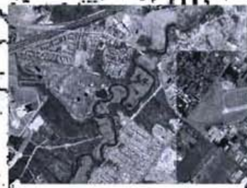
Aerial view of New Castle County