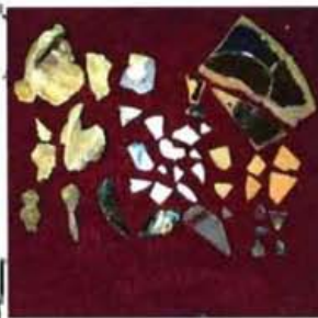
An example of the types of historic artifacts found during archaeological surveys

settlements along the banks of Churchman's Marsh and the Christina River, and the growth of early milling and shipbuilding industries. Later in the 19th and early 20th