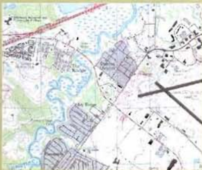
Topographic map showing project area

Following discussions with officials with DelDOT and the Delaware State Historic Preservation Office (DESHPO) it was decided that additional, or Phase II, archaeological studies needed to be performed on one of the prehistoric sites discovered. Archaeologists are currently excavating a larger sample of the site and trying to carefully collect more of the stone artifacts made and used by the Native Americans who once stayed there. They are also looking for other evidence of daily life at the site, such as abandoned fireplaces, storage pits, or signs of the structures people once lived in. It is hoped that detailed studies of the artifacts from this site will reveal important information about when this spot was occupied, and about the ways in which Native American people interacted with the natural world around them.