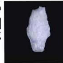
Phase I Survey

centuries the Duross Heights vicinity grew in prominence as a central component of Delaware's developing fruit, grain, and agricultural market. Unfortunately, much of this earlier history has already been lost amid the expansion of commercial and residential construction following World War II.