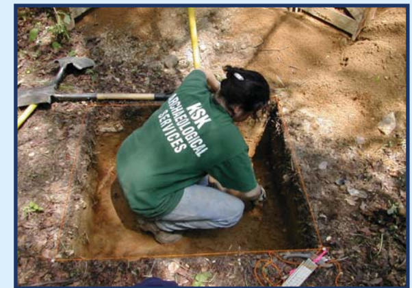
A KSK Archaeologist uses a trowel to carefully excavate the site.

is to learn more about the people who made this site by studying the objects and evidence they left behind. This process involves a combination of careful excavation and the intensive analysis of unearthed artifacts. Particular efforts will be made to reconstruct the activities that took place here thousands of years ago by studying the tools and patterns of artifacts found throughout the site. Specific types of artifacts, like the projectile point shown to the left, in tandem with