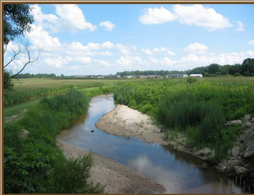
Delaware RTT & RWT Facility Master Plan