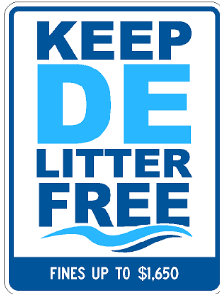
Figure 1: Keep DE Litter Free sign